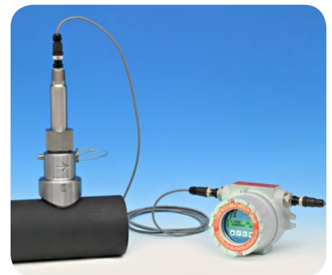
Remote transmitter available up to 300 feet from flow meter